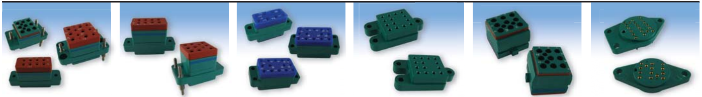
Low Profile Relay Sockets