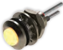
Sealed Panel Indicator LEDs

Based in the small market town of Ulverston, Cumbria in the UK, Marl has been adapting leading LED technology to provide innovative, attractive cost-effective solutions for over 40 years.