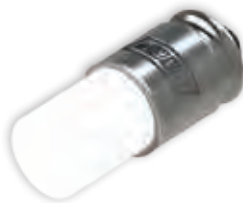
Bulb Replacement LEDs