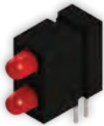
PCB Mounted LEDs