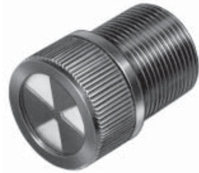
Model MI 6I SA

* See page 28 for additional /1 qualified designs.