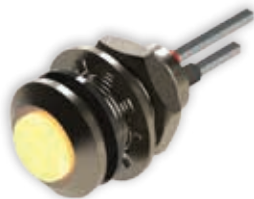
Sealed Panel Indicator LEDs

Based in the small market town of Ulverston, Cumbria in the UK, Marl has been adapting leading LED technology to provide innovative, attractive cost-effective solutions for over 40 years.