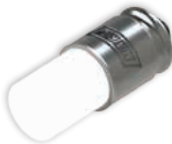
Bulb Replacement LEDs