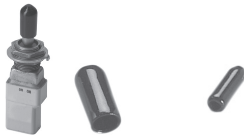
Part Numbers 49-4307 and 49-4308