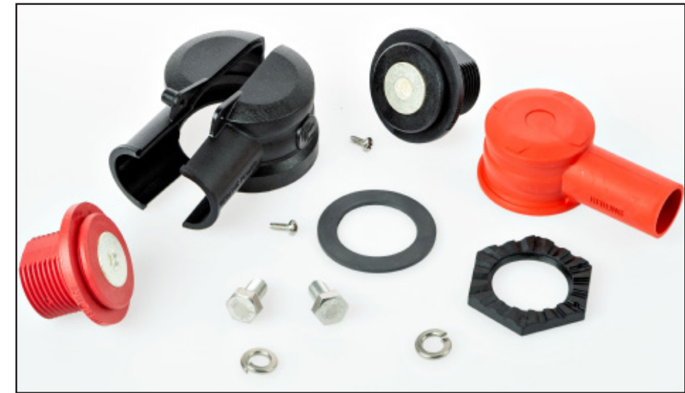
BFT Product Family