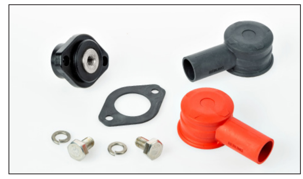
XFT Product Family